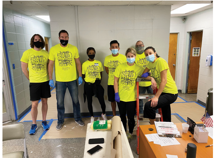
Zeal Church members shown above giving our facility a new paint job!

Zeal Church actively reached out to see how they could serve our organization and support our mission. What started as talks of an individual gift or act of service quickly developed into a true partnership. They have quickly gone above and beyond to support our men! We are so blessed that they reached out and are proud to call them a partner.